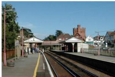
...and how it is today