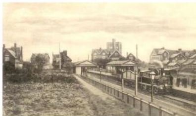
New Milton station c1900...

This was officially accepted in 1896, and so the name New Milton caught on.